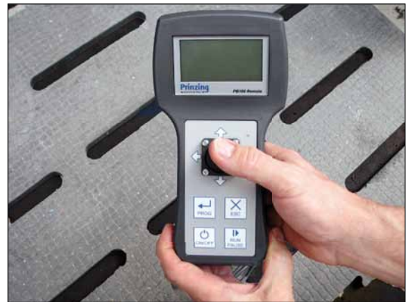
Manual control unit to set the parameters and to move the PriBot manual.