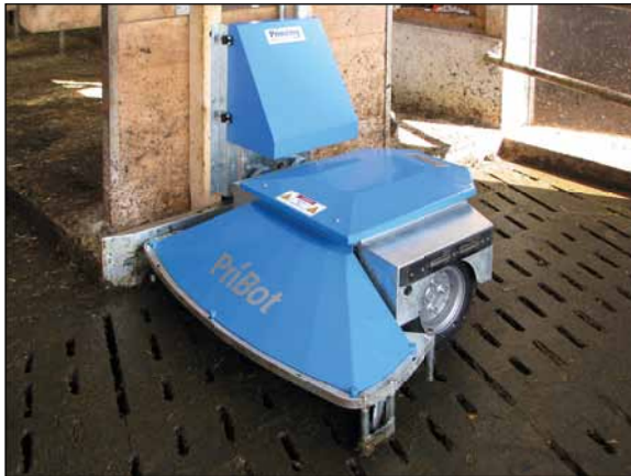
PriBot on the loading station

Compact · Agile · Efficient · Sturdy · Reliable